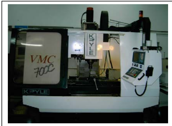
A computerized Vertical Milling machine

Manufacturing engineers make things. Everything that manufacturing engineers do is ultimately tied to the production of goods. Almost everything that we use at home, at work, at play is manufactured. By its official professional definition, manufacturing occurs when the shape, form or properties of a material are altered in a way that adds value to it. Manufactured goods are everywhere—aircraft structures, machinery, electronic parts, medical devices, automobile parts, household products, toys, textiles and clothing, cans and bottles, virtually everything we use.