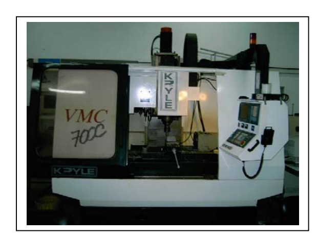
A computerized Vertical Milling machine

Manufacturing engineers make things. Everything that manufacturing engineers do is ultimately tied to the production of goods. Almost everything that we use at home, at work, at play is manufactured. By its official professional definition, manufacturing occurs when the shape, form or properties of a material are altered in a way that adds value to it. Manufactured goods are everywhereaircraft structures, machinery, electronic parts, medical devices, automobile parts, household products, toys, textiles and clothing, bottles, cans and virtually everything we use.