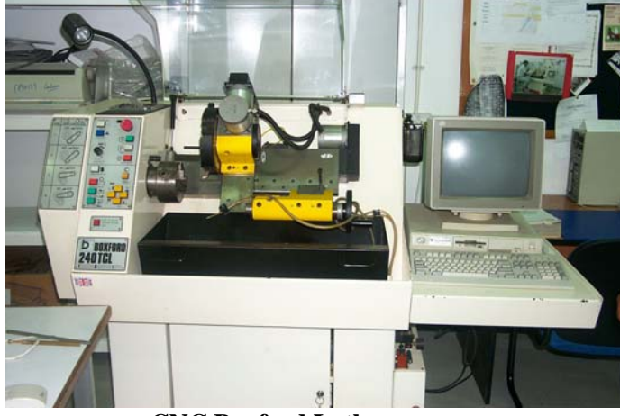
CNC Boxford Lathe

Vacation Training which supplement the labworks already included in most modules. Additionally, the students have to spend one semester (full time) in an industrial environment, to give the practical engineering exposure. This helps the students to apply the knowledge gained previously to solve actual problems and to get acquainted with the usual design and maintenance practices.