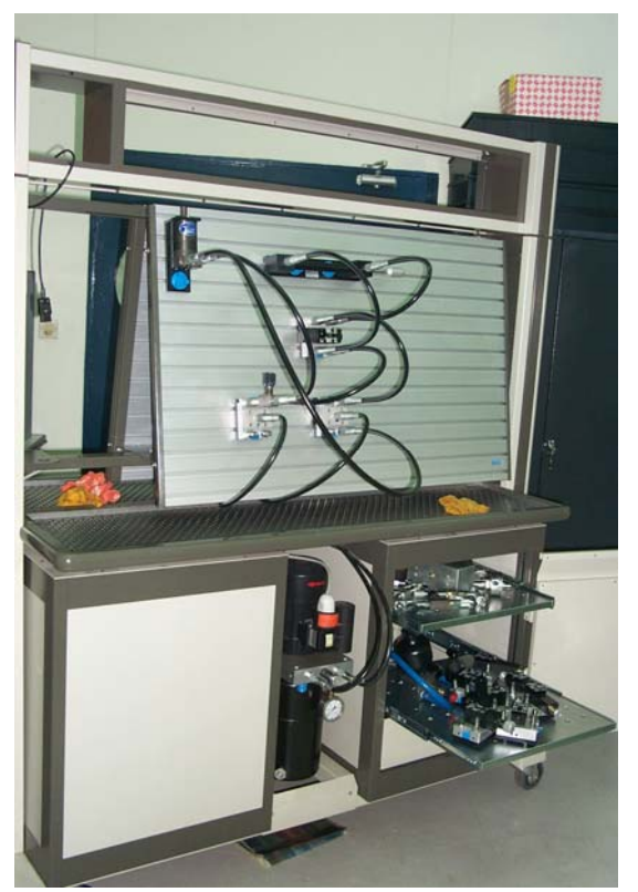
The Hydraulics Workbench

Additionally, the students will also be working in the Electronics Lab, Microprocessor Lab., Machines Lab, and Fluid Dynamics Lab, which are under the responsibilities of other Departments in the same Faculty.